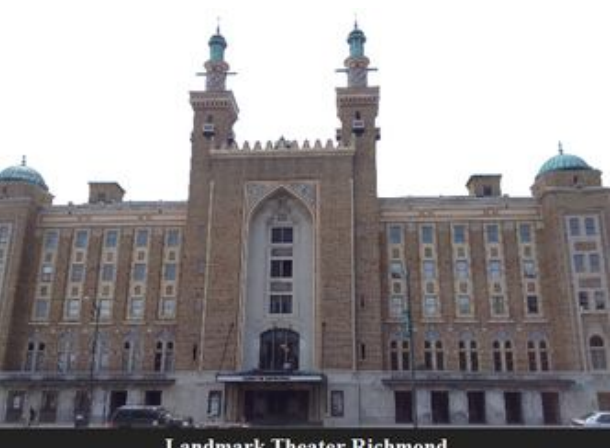
Landmark Theater Richmond

thanked The Sultan of the Moroccan Empire for recognizing the United States Corporation and for the pre-existing business contract/ Treaty of Peace and Friendship which is the longest standing and unbroken treaty in the world yet this great event is not in our school's history books because they do not want the truth to be known.