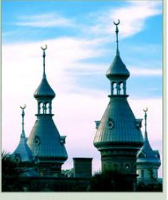
University of Tampa